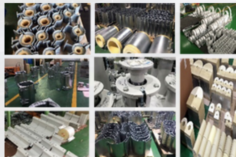
Pipe Hangers & Support