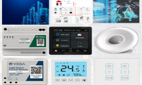
Integrated Building Management Sys