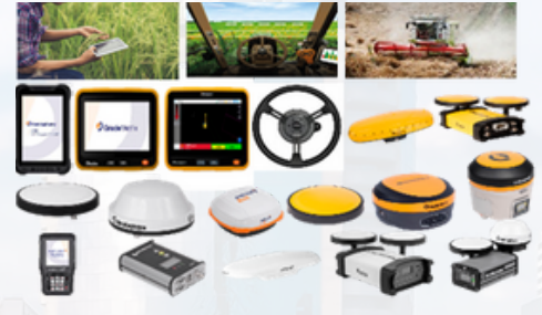
Precision Farming & Building Eqpt