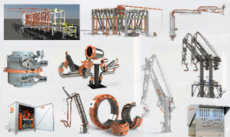
Loading & Transfer Technology