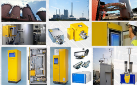
AQM & CEM Measurement & Analysis