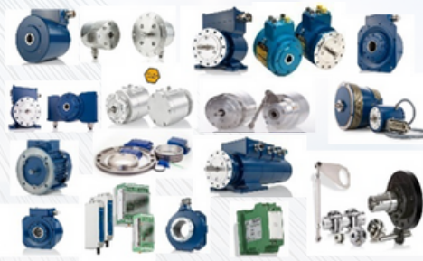
Encoders & Sensor Systems