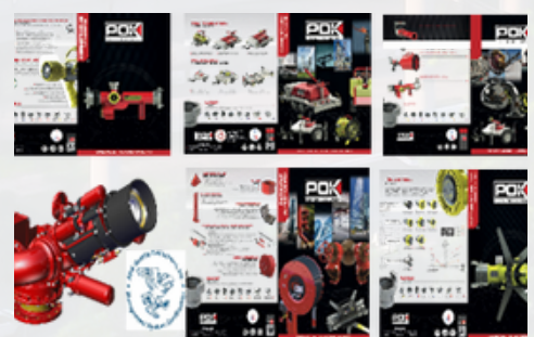
Fire Fighting Equipment