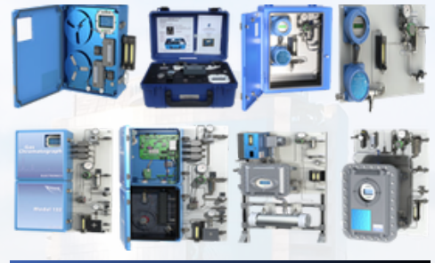
Natural Gas Measurement Eqpt