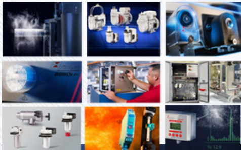
Gas Analysis & Sys Integration