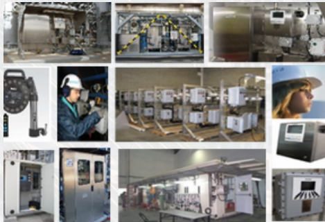
Measurement & Analysis