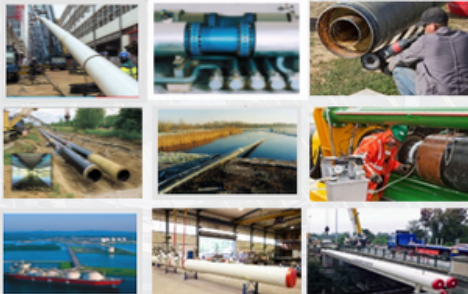
Steel-Case Piping Technology