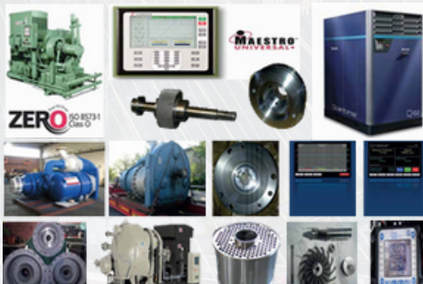
Air Compression Services